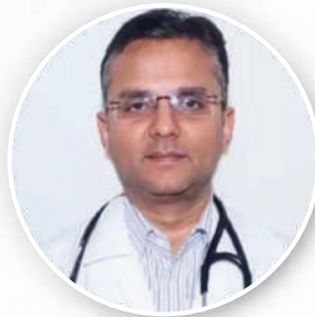
Dr. Harsh Vardhan